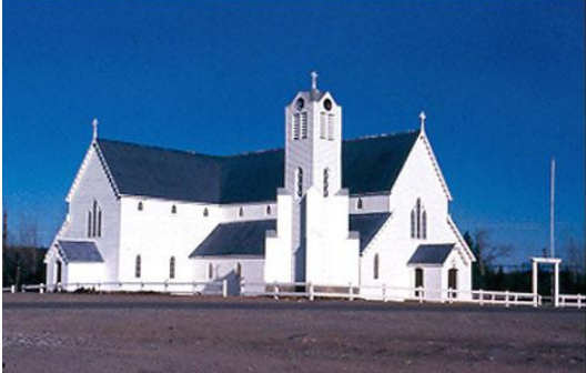
Holy Cross Anglican Church, "The Neck", 1985.

Today in 2022, "The Neck" contains a parish hall and rectory, Holy Cross School Complex which still serves the whole Eastport Peninsula, an Anglican cemetery, a war memorial, a community garden, sports and recreational facilities, a fire hall, a fraternity lodge (SUF) and other structures. "The Neck" remains today a well utilized and important part of our community.