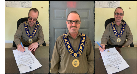
Mayor Arthur Crisby signing the Proclamation of Heritage Week 2022

Heritage NL (Heritage Foundation of Newfoundland and Labrador) is a not-for-profit Crown agency of the Department of Tourism, Culture, Arts and Recreation. Established by the Government of Newfoundland and Labrador in 1984, Heritage NL is managed by a government-appointed board of directors with representation from across the province.